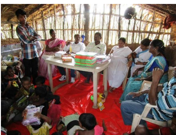
Picture 2. Child Rights awareness meeting is being conducted by the government department officials at Allivarigudem settlement in Kannaigudem mandal 2019