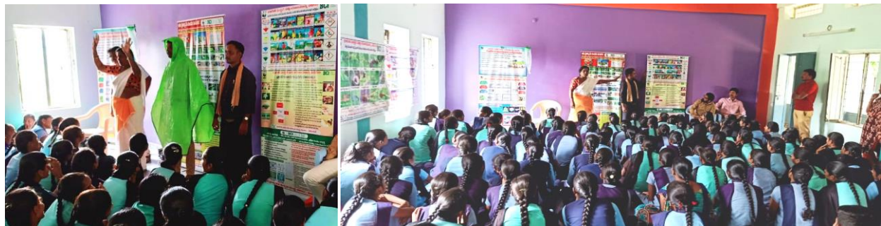
Educating School children on PPE, Child labour and hazards works in cotton fields