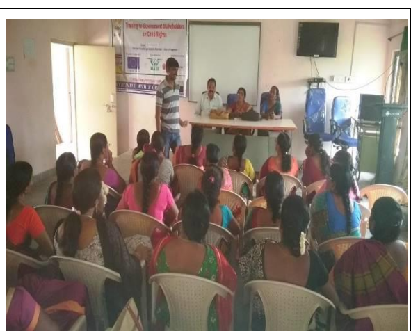
Picture 16. Training for Health & Education Dept. officers and works in Eturunagaram Headquarters 2019