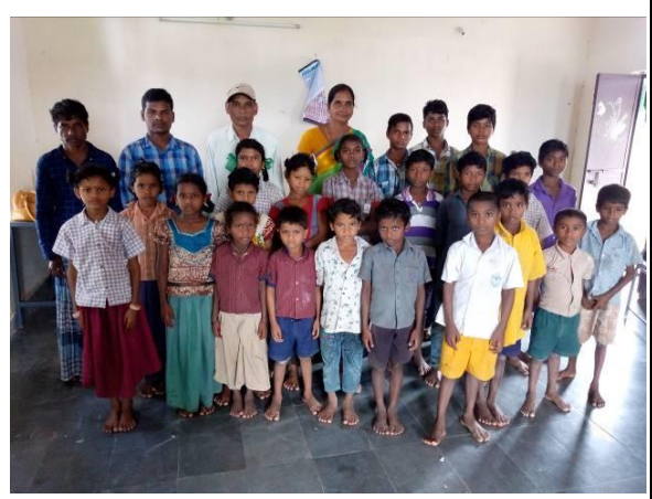
Picture 15. Children from CFLS mainstreamed into government schools, June, 19