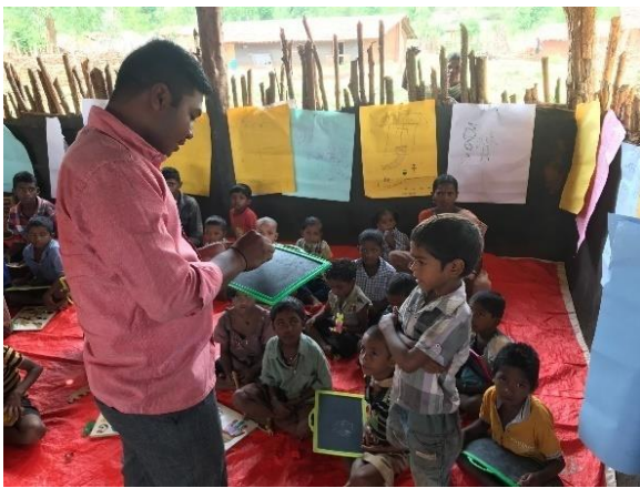
Picture 9. Children accessing basic education in PPECs 2019