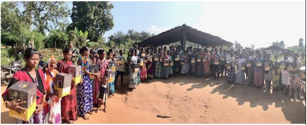
Picture 17. Distribution of Solar Lanterns in the IDP Settlements as a campaign to '# light up her life #' which has helped in providing illumination of remote locations to ensure child protection.