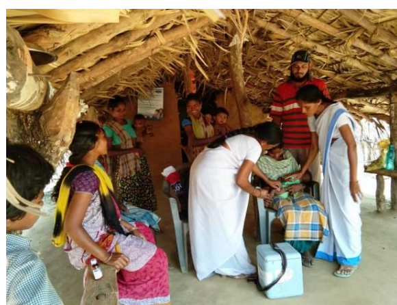
Picture 7. Immunization services offered by the medical department in the settlement 2019