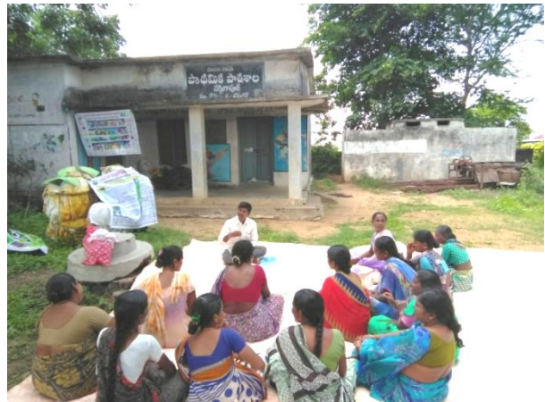
LG 77 Narsingapur Village LG training