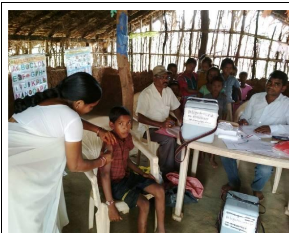
Picture 14. Special vaccination drives facilitated in the settlements (Project Nagar), 2019