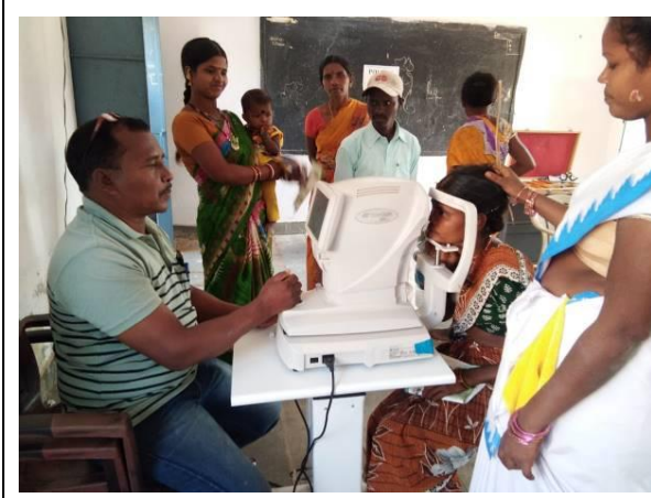
Picture 13. Eye Check-up camps facilitated for IDP communities in Eturunagaram