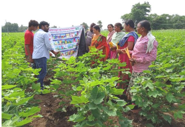
LG. 78 precautions of PPE before spraying.

All the 4 PUs have successfully received licenses to sell the Better Cotton. MARI has collected evidences that 50% of the cotton produced was sold to licensed ginners.